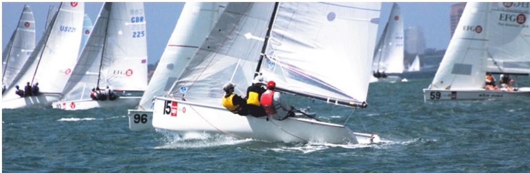
All Miami photos courtesy of Dan Tucker, Rondar Raceboats