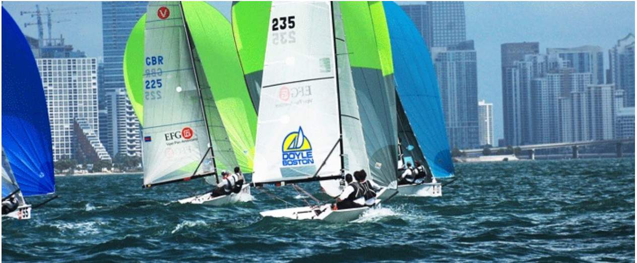
Fast Sailing on Miami's Biscayne Bay