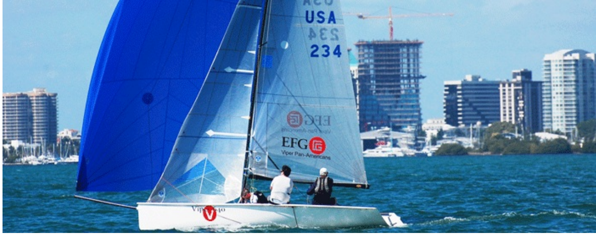
Coral Gables skyline behind happy...and warm...Viper sailors.