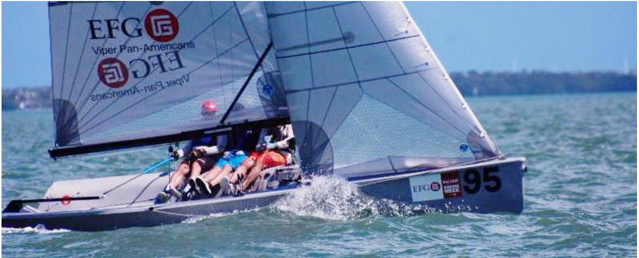
Fast Sailing on Miami's Biscayne Bay